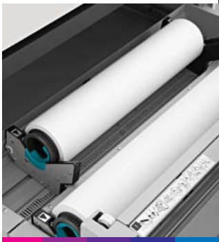
wide format printer/copier/scanner