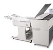
Production Print Stacking