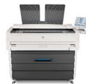
MFP - Single Footprint System

The Energy Star ® qualified KIP 7100 employs adjustable sleep modes to keep power consumption to a minimum while providing fast print times to keep busy workgroups moving. High yielding, 100% efficient high definition toner delivers on the promise of maximum system uptime.