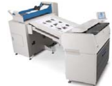
Auto Stacking & Folding